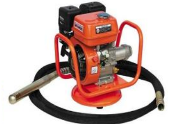
Concrete Needle Vibrator