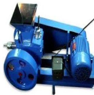
Laboratory Jaw Crusher