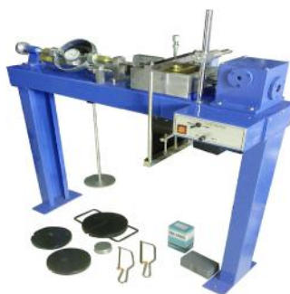
Direct Shear Test Apparatus