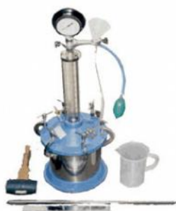
Air Entrainment Meter