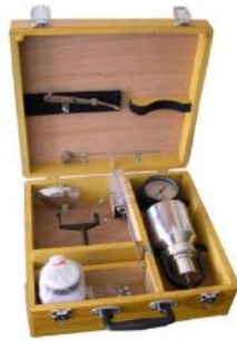
Rapid Moisture Meter