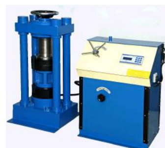
CTM Pillar Model