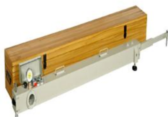
Benkelman Beam Apparatus