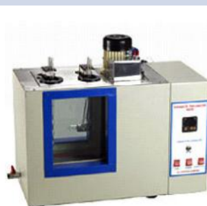
Kinematic Viscosity Bath