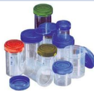
Laboratory Plastic Ware