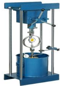
Swell Test Apparatus