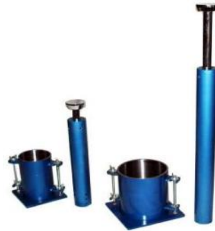
Proctor Compaction Apparatus