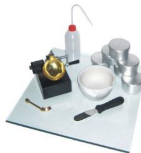
Atterberg Limit test