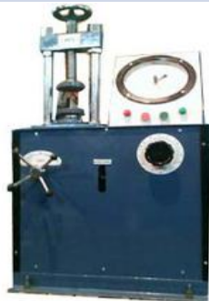
Point Load Index Motorised