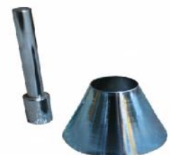
Sand Absorption Cone And Tamper