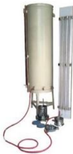
Soil Permeability Apparatus