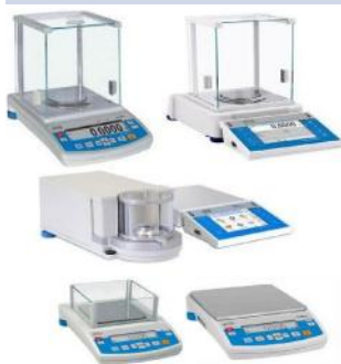
Laboratory Weighing Balance