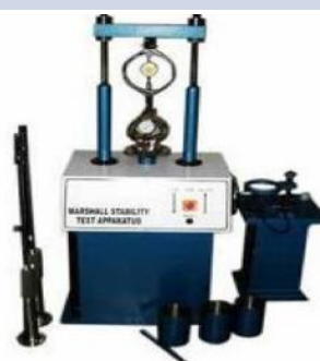
Marshall Stability Test Apparatus