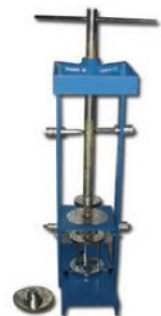
Sample Extractor Apparatus