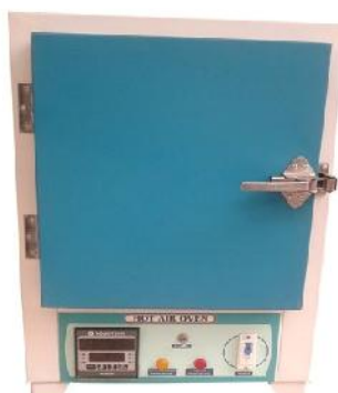
Hot Air Oven