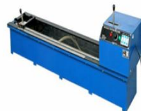
Ductility Testing Machine