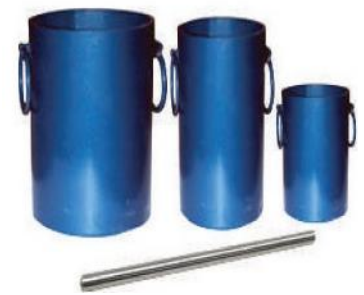
Cylindrical Metal Measure