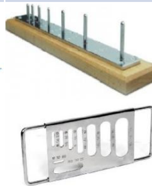
Elongation & Flakiness Gauge