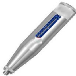
Concrete Test Hammer