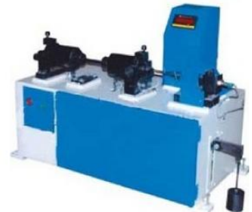
Fatigue Testing Machine