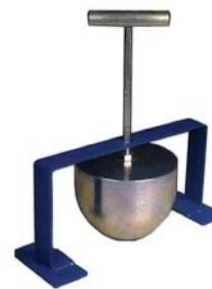
Kelley Ball Penetration Apparatus