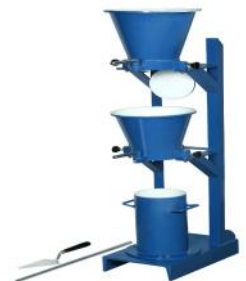
Compaction Factor Apparatus