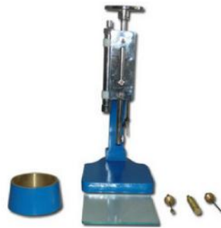
Vicat Needle Apparatus