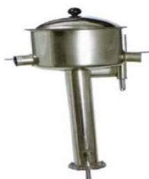
Water Still Wall mounted