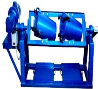
Deval Abrasion Testing Machine