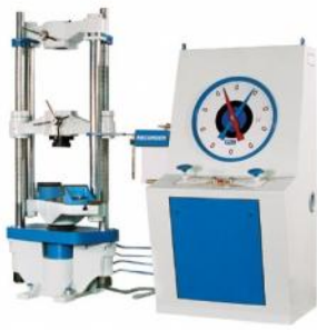
Universal Testing Machine Mechanical