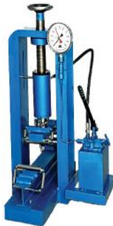
Beam Flexure Testing Machine