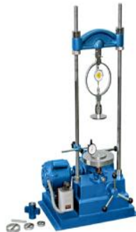
Unconfined Compression Test