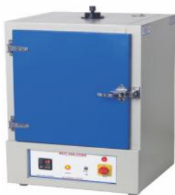
Hot Air Oven