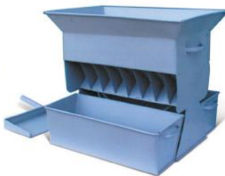
Riffle Sample Divider