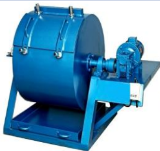
Los Angeles Abrasion Testing Machine