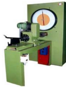
Torsion Testing Machine