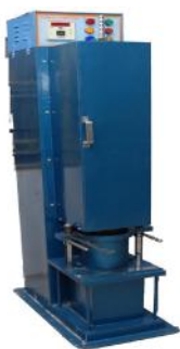
Automatic Marshal Compactor