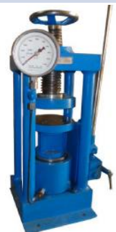
Compression Testing Machine 500 kN