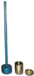
Core Cutter with Dolly and Rammer