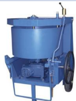
Pan Type Mixer