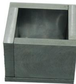
Cube Mould Size 70.6 x 70.6 mm