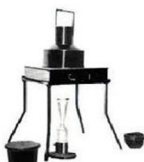
Conradson Carbon Residue Apparatus