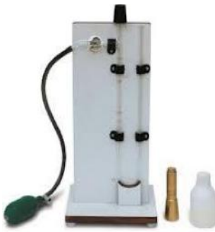
Blain Air Permeability Apparatus