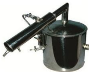
Water Still Manesty type