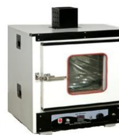
Thin Film Oven