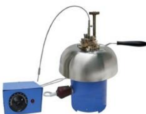
Pensky Marten Flash Point Apparatus