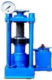
Compression Testing Machine 4 Pillar Model