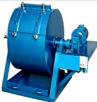
Los Angle Abrasion Test