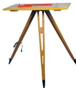
Plane Survey Table