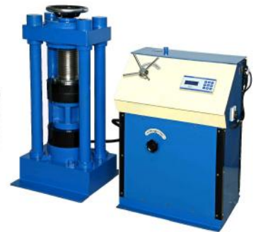
Compression Testing Machine