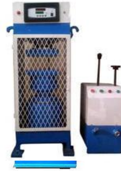
Compression Testing Machine Plate Model