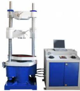
Universal Testing Machine Computerized