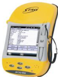
GPS System Instrument