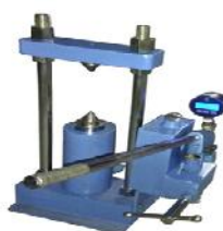
Point Load Tester