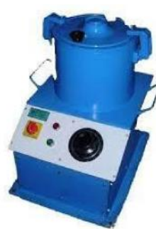
Bitumen Extractor Electrically Operated