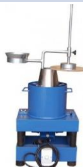
Vee Bee Consistometer