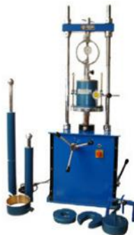
Laboratory C.B.R. Apparatus