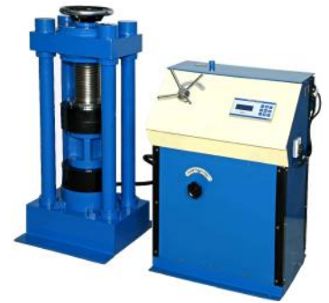
Compression Testing Machine Electric Model