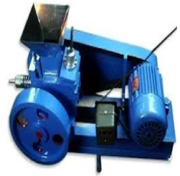
Laboratory Jaw Crusher