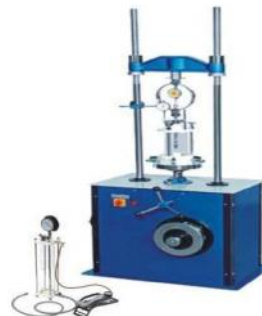
Triaxial Shear Test Apparatus