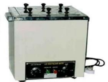
Water Bath For Soundness Test