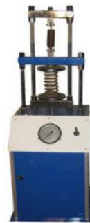
Spring Testing Machine