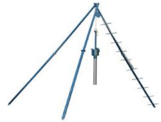
Standard Penetration Test