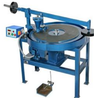
Tile Abrasion Testing Machine