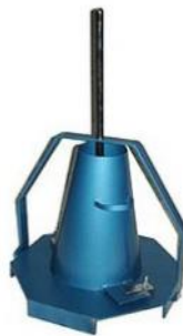
Slump Cone Test Apparatus