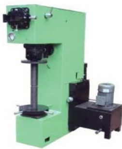
Brinell Hardness Testing Machine