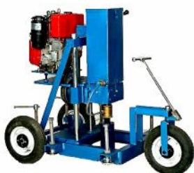
Core Drilling Machine