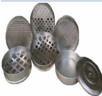
Coarse Aggregate Sieves