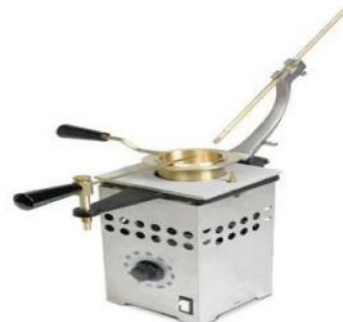
Cleveland Flash & Fire Apparatus