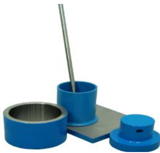
Aggregate Crushing Value Apparatus