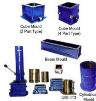
All types of Concrete Moulds