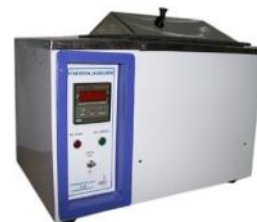
Water Bath Serological