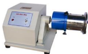
Laboratory Ball Mill