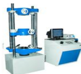
UTM – Digital