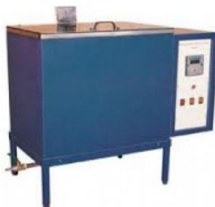
Accelerated Curing Tank