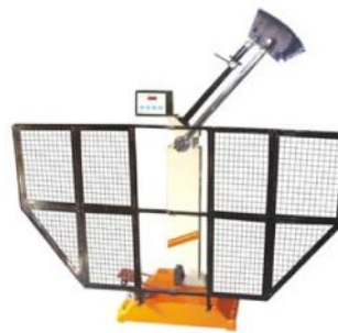
Pendulum Impact Testing Machine