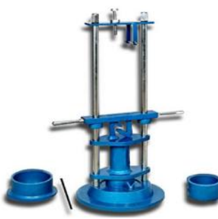
Aggregate Impact Value Testing Machine