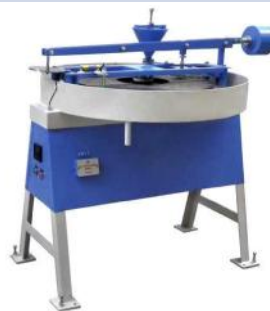
Dorry Abrasion Testing Machine