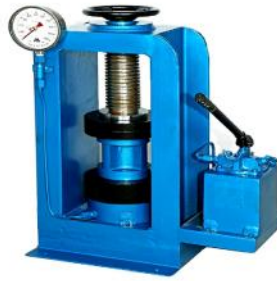
Compression Testing Machine Channel Model