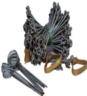
Survey Measuring Chain