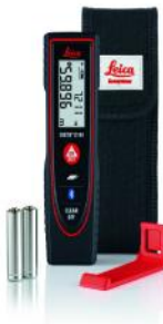
Laser Distance Meter