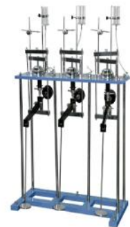
Consolidation Test Apparatus