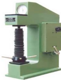
Rockwell Hardness Testing Machine