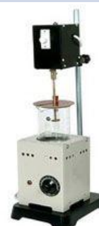
Softening Point Apparatus / Ring And Ball Apparatus