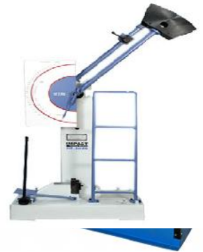
Izod Impact Testing Machine